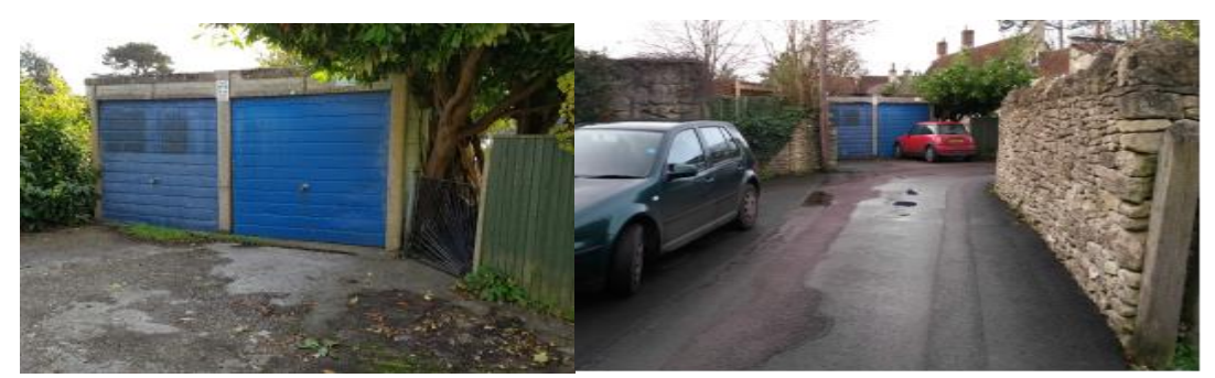
The position of the site's existing vehicular access is captured on the upper right photograph. On the extreme right, a wooden gate post forms part of the opening.

The use of a wooden gate to conceal the turntable and parking area would retain the existing enclosed appearance and character of the application site, whilst still providing a practical solution for the site. Officers furthermore duly assert that the proposed treatment would be appropriate to the Conservation Area. By way of an example, within the conservation area, parking can be seen outside of the boundary walls or behind modern garage doors as illustrated in the site photographs reproduced below.